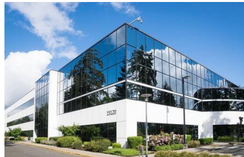
Facilities Maintenance (commercial)