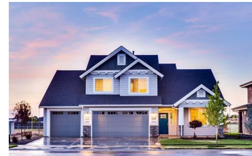
Real Estate, Asset & Default Management (residential)